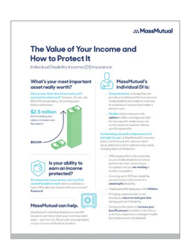
The value of your income and how to protect it