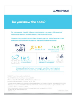
Do you know the odds?