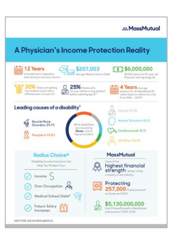
A physician's income protection reality