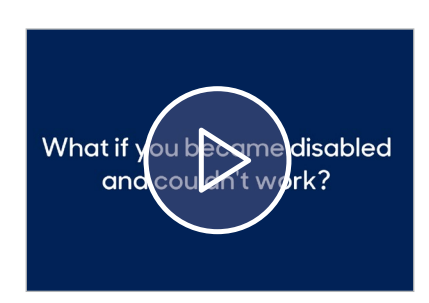
Savings and Disability