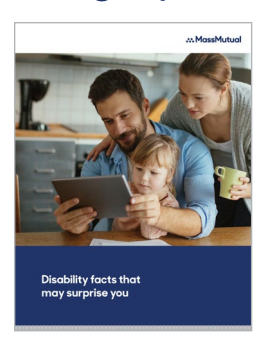
Disability facts that may surprise you