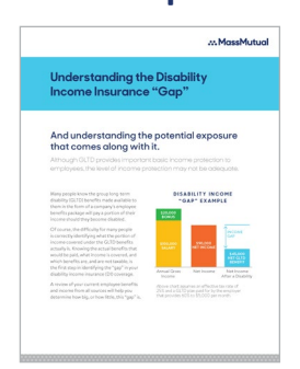
Understanding the DI Gap